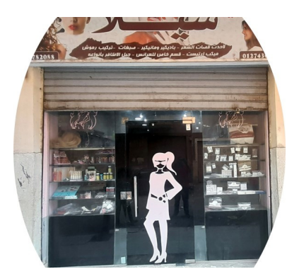
Figure 2: Marina Awad's Salon (exterier)